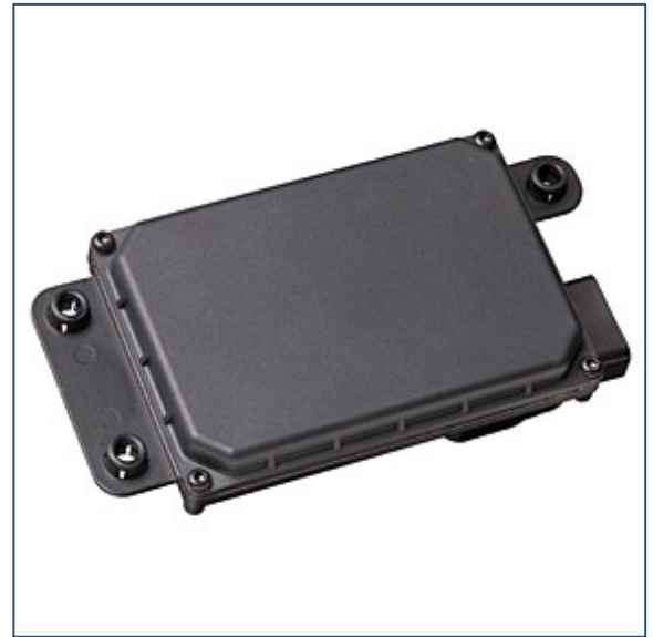
The radar module, including electronics, measures just 173.7 x 90.2 x 49.2 millimeters including mounting features.