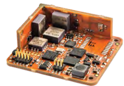
MTi OEM: 37x33x12 mm, 11g, 16-pins header