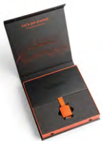
MTi 100-series Development Kit: MTi, software and cabling