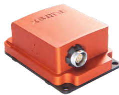
MTi encased: 57x42x23.5 mm, 52g, 9-pins push-pull connector