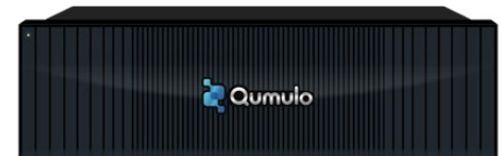
QC104 | QC208 | QC260 | QC360